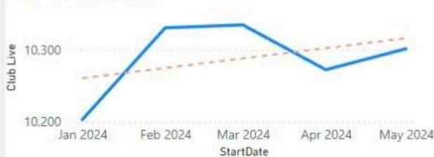
Club Live by Month